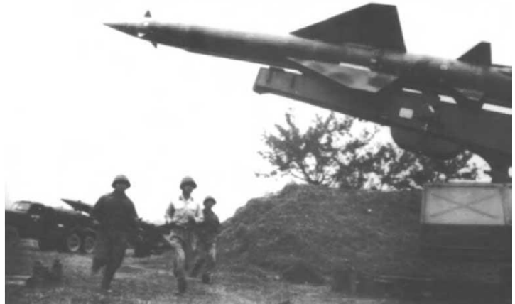
North Vietnamese SA-2 ground to air missile – as the North Vietnamese acquired more of these from the Soviet Union, it challenged the Americans’ ability to develop countermeasures. Technology was constantly in flux in order for each side to try and gain an edge.