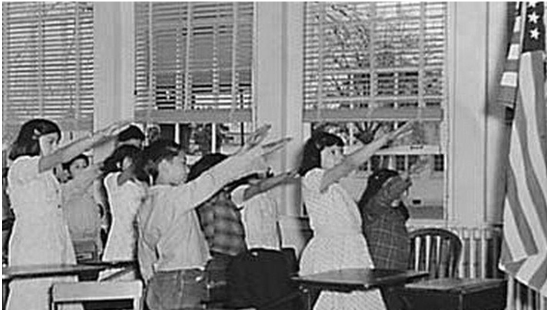
Students give the “Bellamy Salute,” discontinued for obvious reasons in 1942

The “Bellamy Salute,” which was taught in public schools for years, bore an uncanny resemblance to another salute which became a symbol of everything America stood against. Its use was discontinued in 1942.