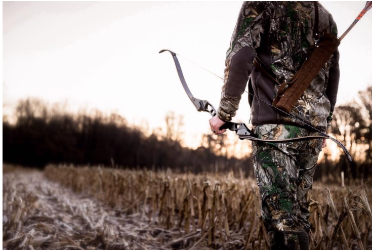
There are three basic methods for doing this.