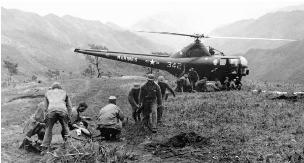
The courageous pilots of early helicopters took these “eggbeaters” into dangerous situations repeatedly to save the lives of countless service members during the Korean War.

Military helicopter rescues for three points: Military helicopters have been saving lives for over half a century. The words Medevac and Dustoff are words that inspire confidence among American fighting forces. Many are familiar with the work of early helicopter pilots in Korea. But the first rescue by helicopter took place before Korea. When and where was the first military helicopter rescue?