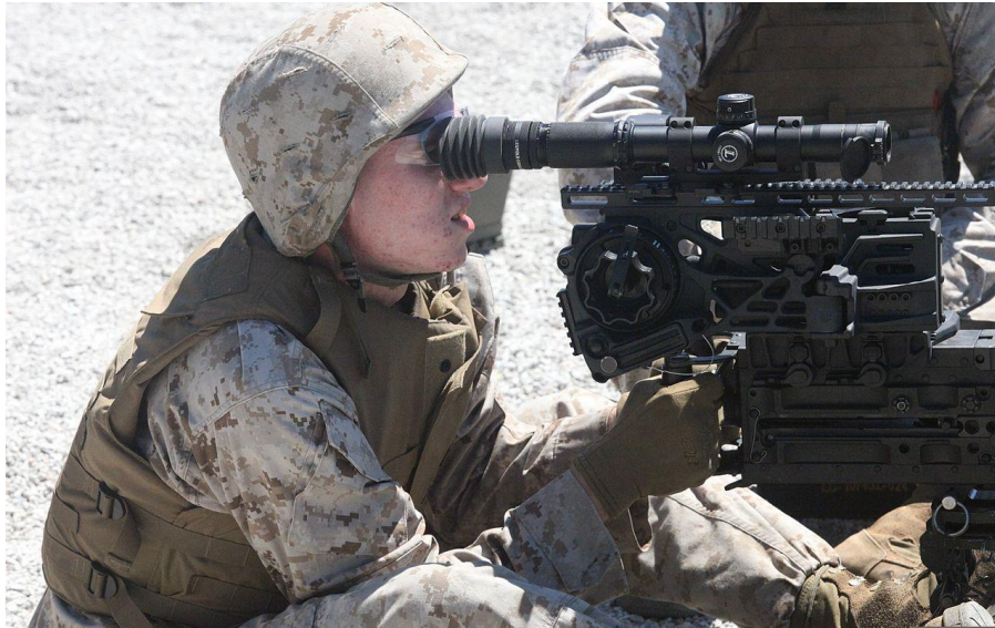
Doing it Hathcock style – a USMC gunner utilizing a Leupold variable power combat optic mounted to a “Ma Deuce,” the M2 .50 cal.

For three points – in New York, there are specific regulations as to the size of shot you can use when turkey hunting. What is the size range of allowable shot for turkey hunting?