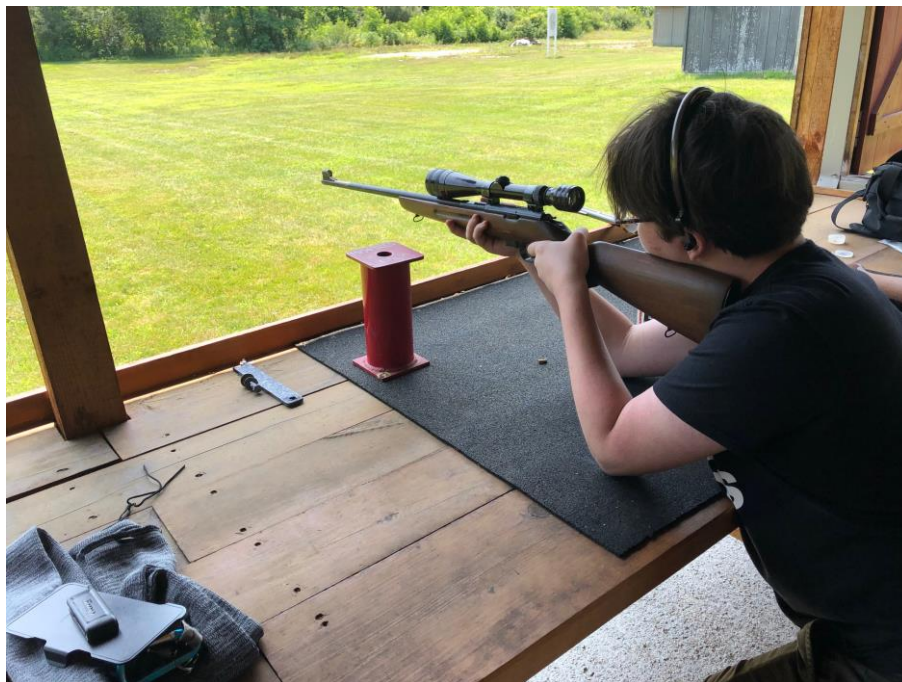
My young Godson, after enduring my instruction, successfully engaging targets for the first time and warming the heart of this old infantryman!