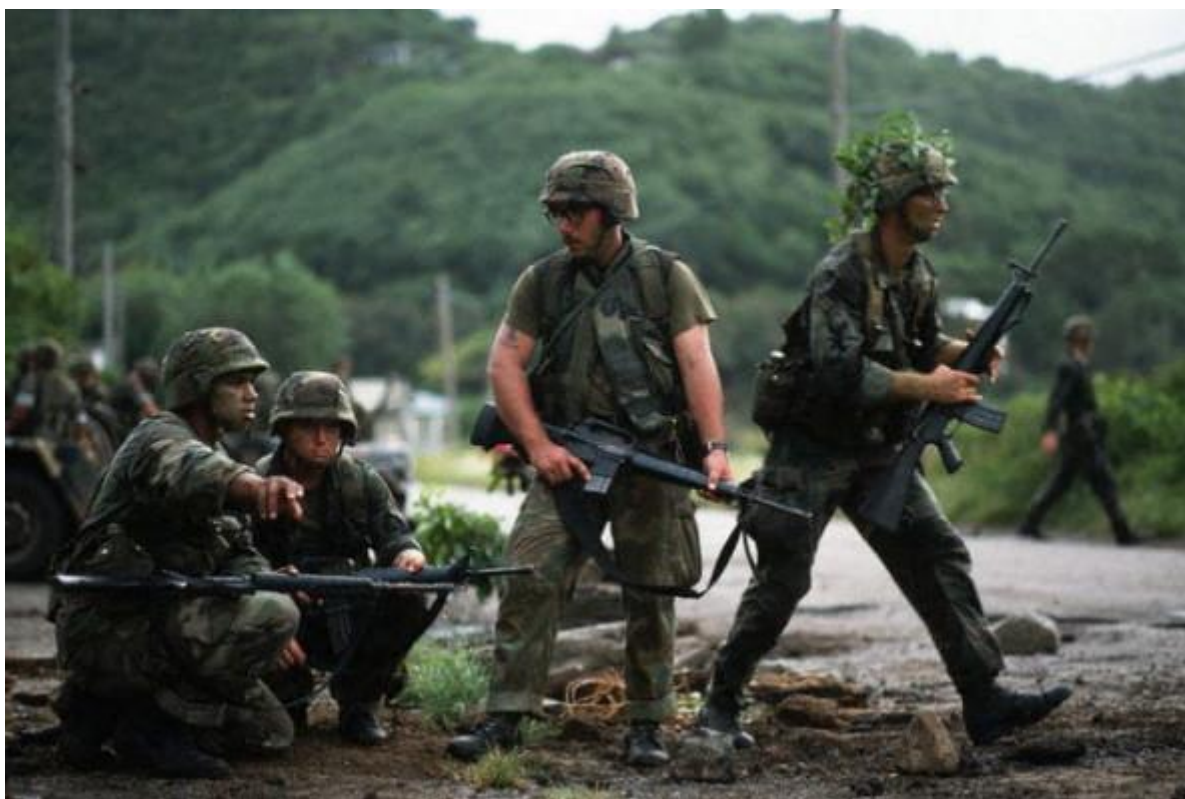
American warfare, 1983 style – the invasion of Grenada, October 1983

The first question, for one point – in 1983, President Ronald Reagan ordered the invasion of the small island of Grenada following the overthrow of their government, in order to ensure the safety of 1,000 Americans on the island. What was the name of the Marxist who overthrew the island’s government?