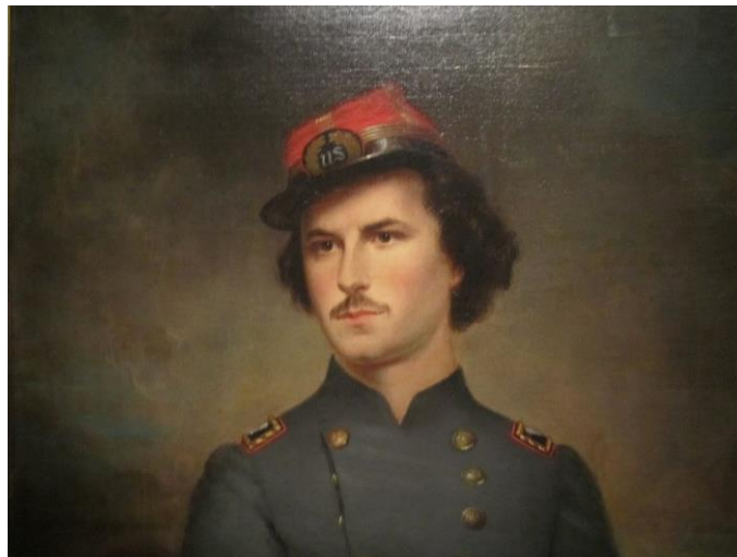
The first Union officer killed in the Civil War – May 24, 1861

For one point – the first Union officer killed in the Civil War has particular interest to those from Upstate NY. Who was he, where was he from, and where was he killed?