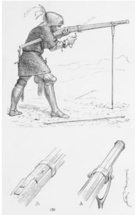
An 1876 image of an arquebus being fired from a fork rest

For one point – the first Union officer killed in the Civil War has particular interest to those from Upstate NY. Who was he, where was he from, and where was he killed?