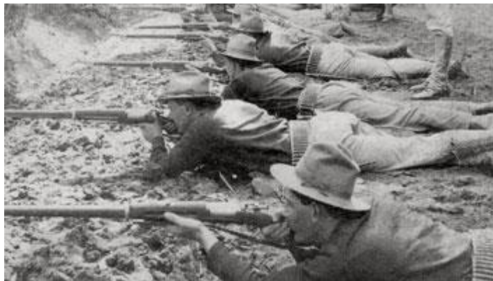
Krag-Jorgensens on the firing line, ca. 1899

Well, the answer was the 30-40 Krag, officially known as 30-40 ARMY or 30-40 US. It was used in the Krag-Jorgensen rifle, the standard issue rifle for Regular Army troops during the Spanish-American War.