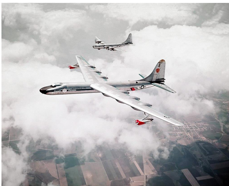
The NB-36H in flight. Want to do a ride-along? Nope...