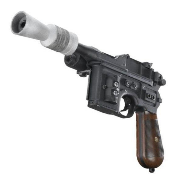
DL-44 Heavy Blaster Pistol