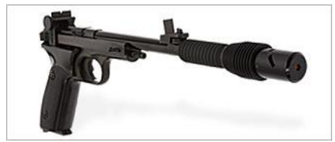
X-30 Blaster Pistol