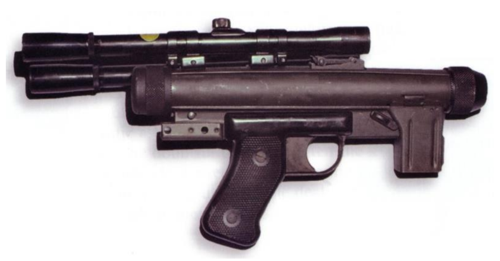
SE-14C Blaster Pistol