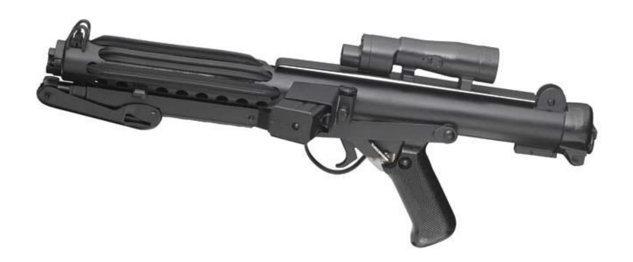
E-11 Blaster Rifle