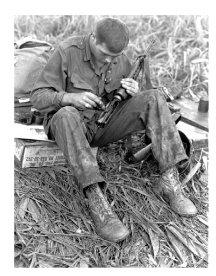
Photo (left): A scene many soldiers are familiar with – breakdown and cleaning individual weapons in the field. In this pic, circa 1966, a soldier of the 101<sup>st</sup> Airborne cleans his XM-16E1 rifle. "X" normally indicates an experimental fielding.

Following repeated reports of the M16's failure in combat (primarily jamming), the Army was hauled over the coals by Congress, eventually resulting in an updated M16 model. So the first question is: What were the most important changes to the M16 when the Army undertook corrective actions in response to the Congressional investigation?