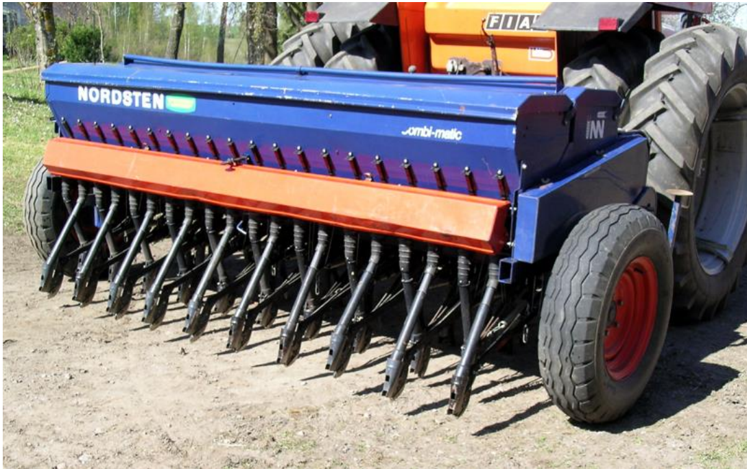
The other kind of “sowing machine” – the modern version of the seed drill.