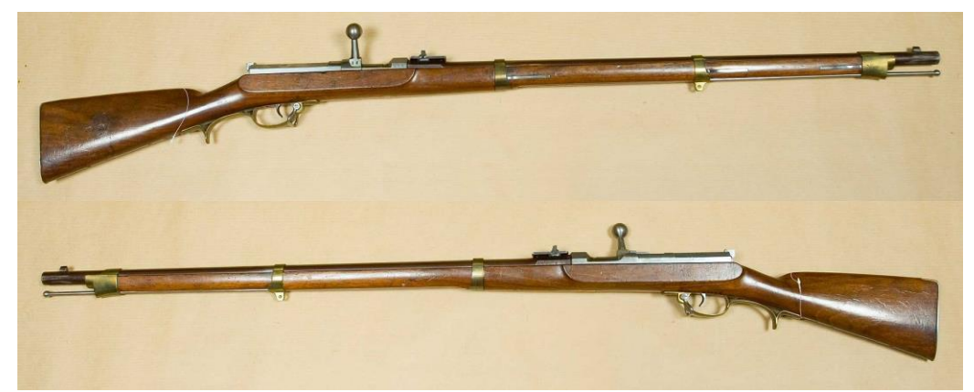
The Prussian model 1841 "Needle Gun," the first bolt rifle adopted for service

The answer is the Nadelgewehr, also known as the "Needle Rifle" – invented between 1824 and 1836 in various versions by Johann Nikolaus von Dreyse, and it was adopted by the Prussian Army in 1841.