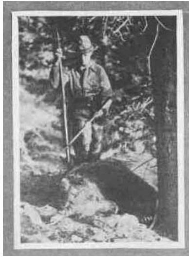
Saxton Pope grizzly hunting at Yellowstone

Third – New York Governors for 2 points. Three New York Governors served in uniform during World War II, two in the Army and one in the Navy. Two served in uniform before they were Governor, and one did after. Which served in which branch of the service? Who is the one who donned the uniform AFTER leaving office?