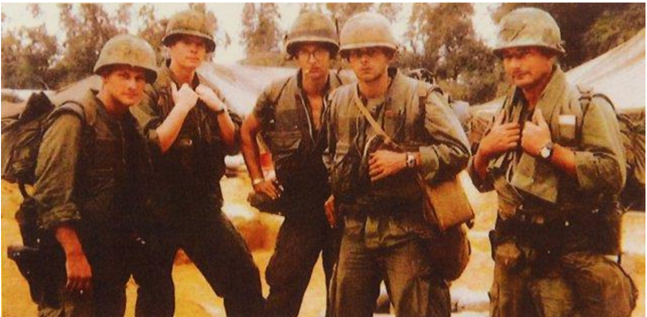
US Marines in Vietnam. Fred Smith, second from right, would later be the founder of FEDEX and serve as its CEO.

Bonus question (2 points) – This founder of a major package shipping company served as a Marine in the Vietnam War as a platoon leader and forward air controller, being awarded a Silver Star in the process. Who was he?