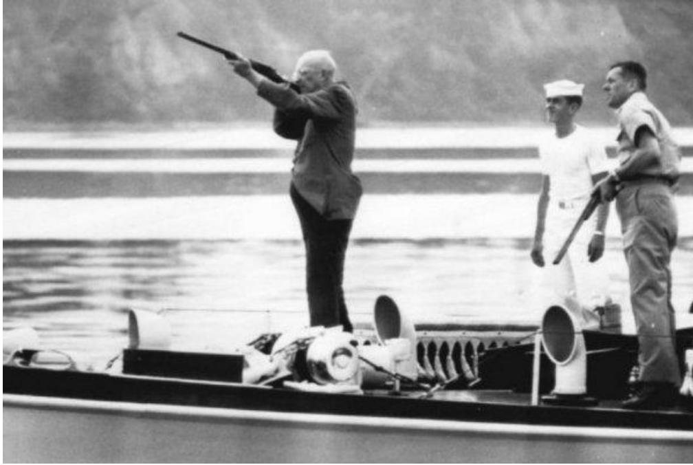
President Eisenhower shooting sporting clays with a Navy Captain on the “Barbara Ann” near Camp David, Maryland