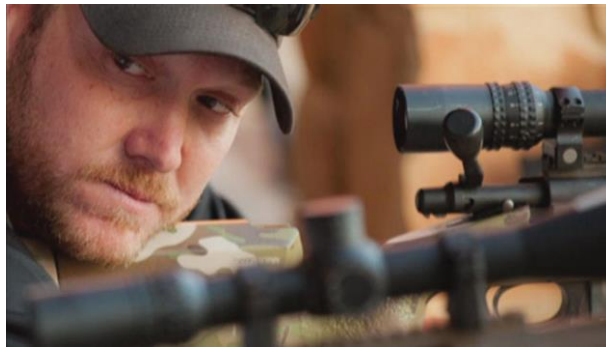
Navy SEAL Chris Kyle (1974-2013)