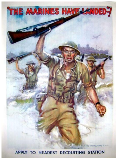
USMC Recruiting Poster – based on these leathernecks’ uniforms, I’d say late 30s, early 40s.

Presidents: Who was the first President to die in office – and what other distinction does this President hold?