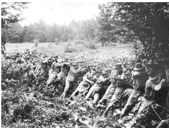
Photo: Circa 1900 - American soldiers in combat for what would be the first of many times in the 20 th Century in Southeast Asia, in this case the Philippines. While these Americans were sweating in wool uniforms and firing 30-40 Krag-Jorgensen rifles, the British were fighting their own counter-insurgency war, but in southern Africa in the Boer War, referenced in the first trivia question for this week. The Americans rapidly ditched the wool uniforms and replaced them with tropical uniforms imported from Hong Kong...

Military: US Marines have a number of nicknames, but one of the most enduring is "leatherneck." To what does this refer?